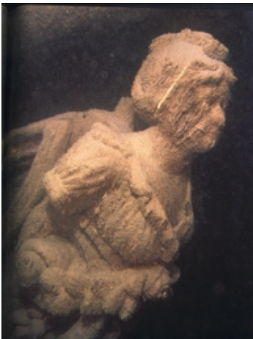
Figurehead of the HAMILTON , originally an American merchant schooner named DIANA . It was purchased by the US Navy and refitted for combat.

One of the most spectacular historical finds of Lake Ontario's past is the discovery of these two sunken War of 1812 US Navy armed schooners.