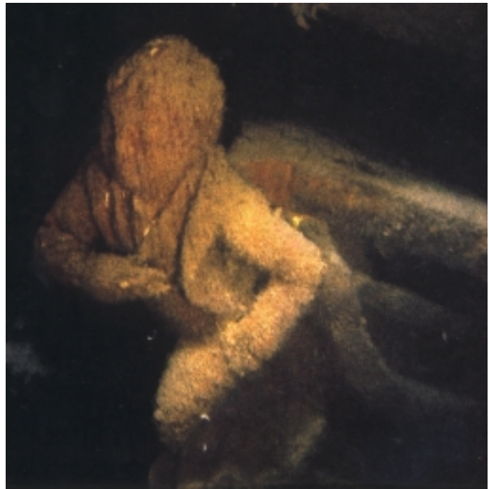
Figurehead of the SCOURGE , originally a Canadian schooner named LORD NELSON . Likeness is that of British Admiral Horatio Nelson . The vessel was captured and renamed by the Americans before the war broke out.

Both ships were lost during the War of 1812 maneuvers in Canadian waters near Niagara River . They went to the bottom in a fierce storm on August 8, 1813 .